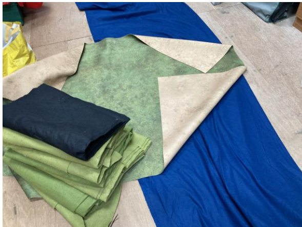
1 - Mats