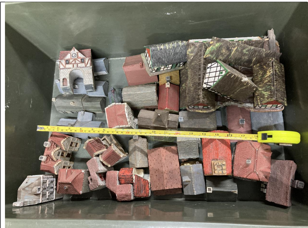
15 - 15mm Buildings