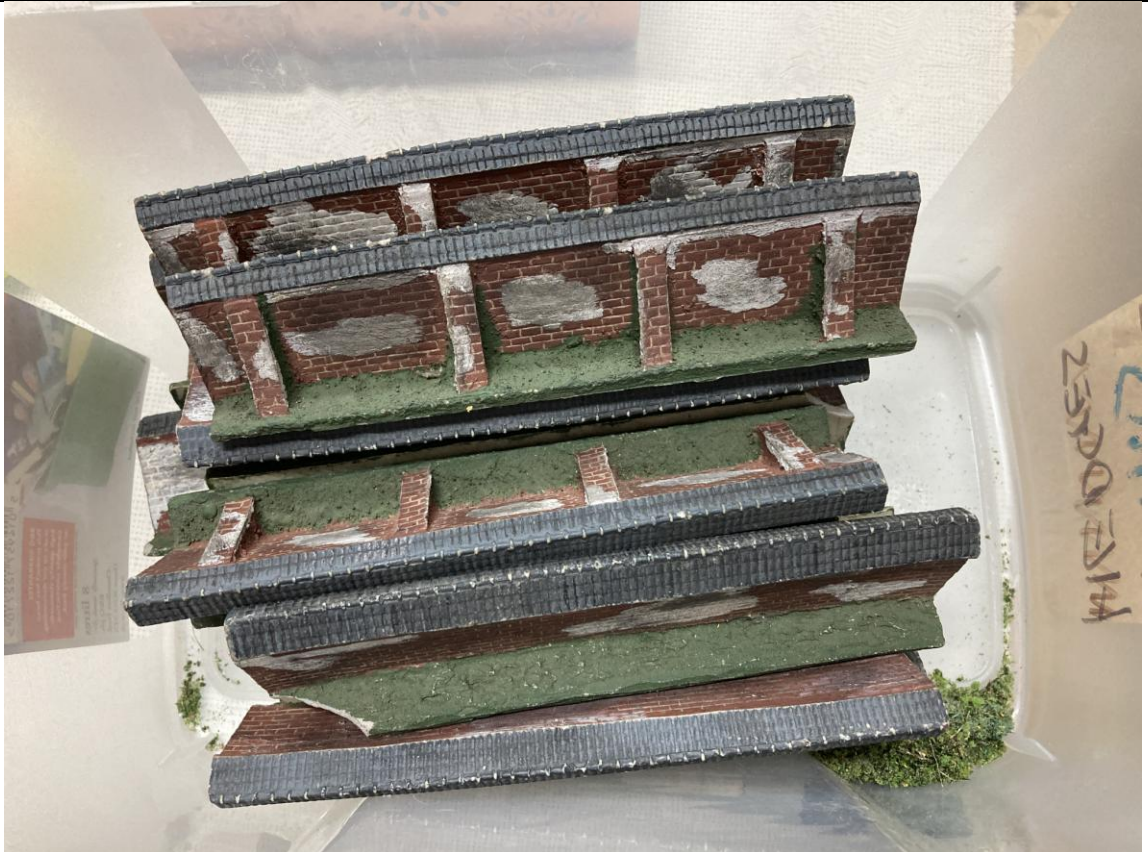
6 - 28mm Walls