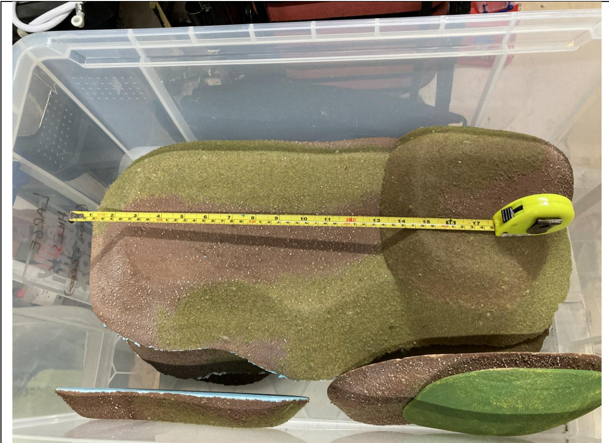
12 - Large Hills, Brown & Green