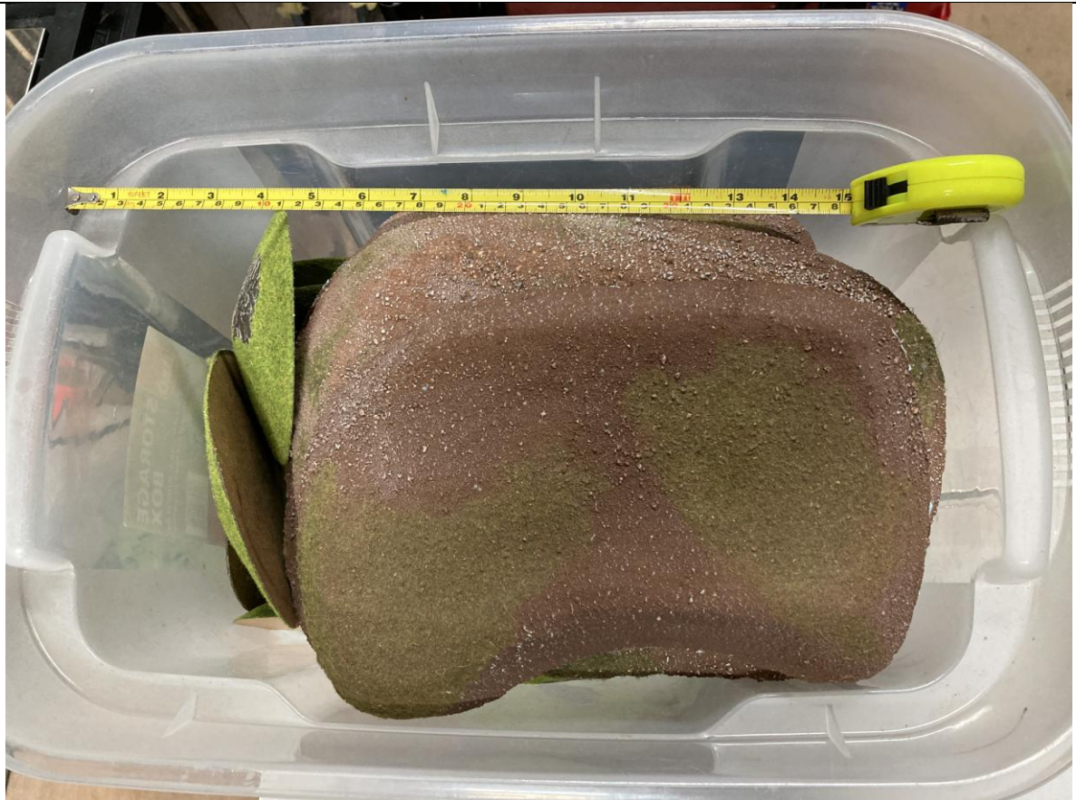
18 - Small Hills