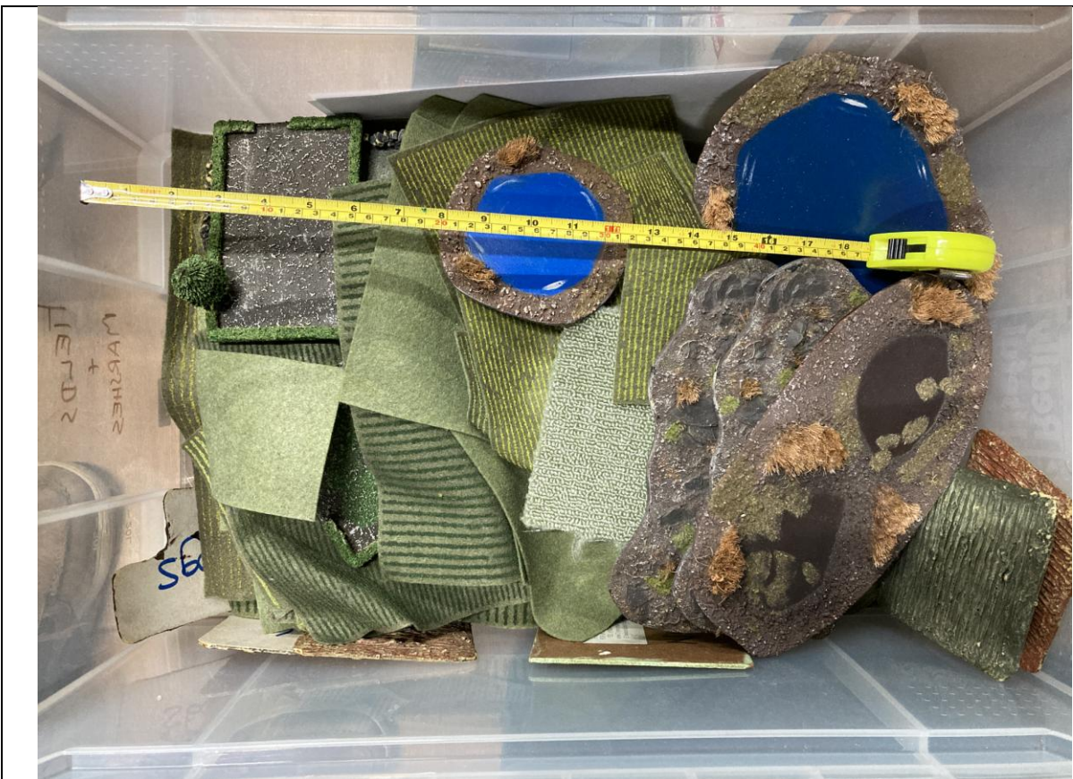
13 - Fields and Marshes