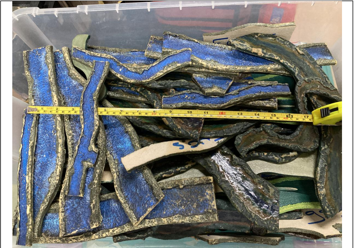
8 - Rivers