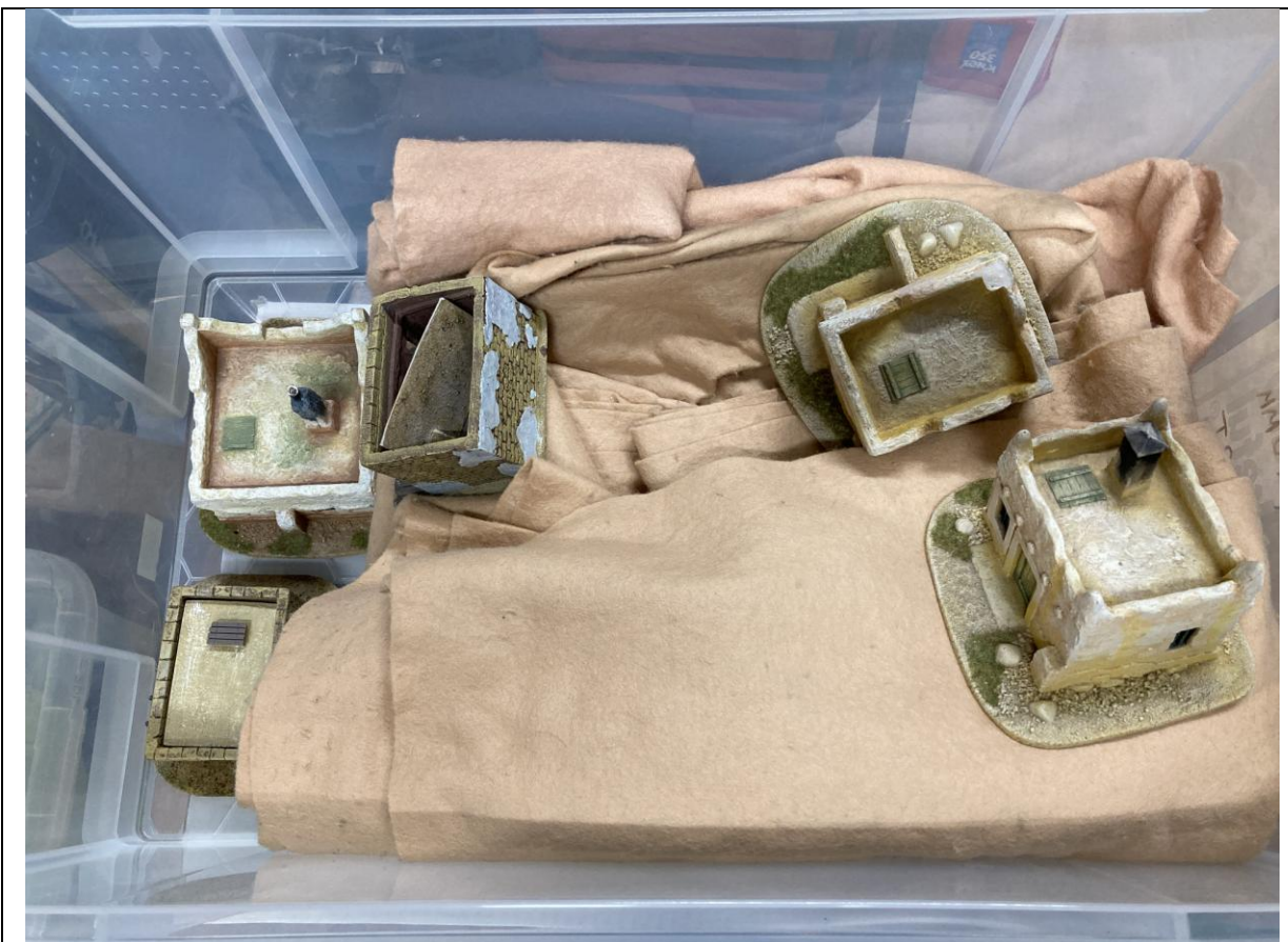
11 - Desert 1 (28mm)