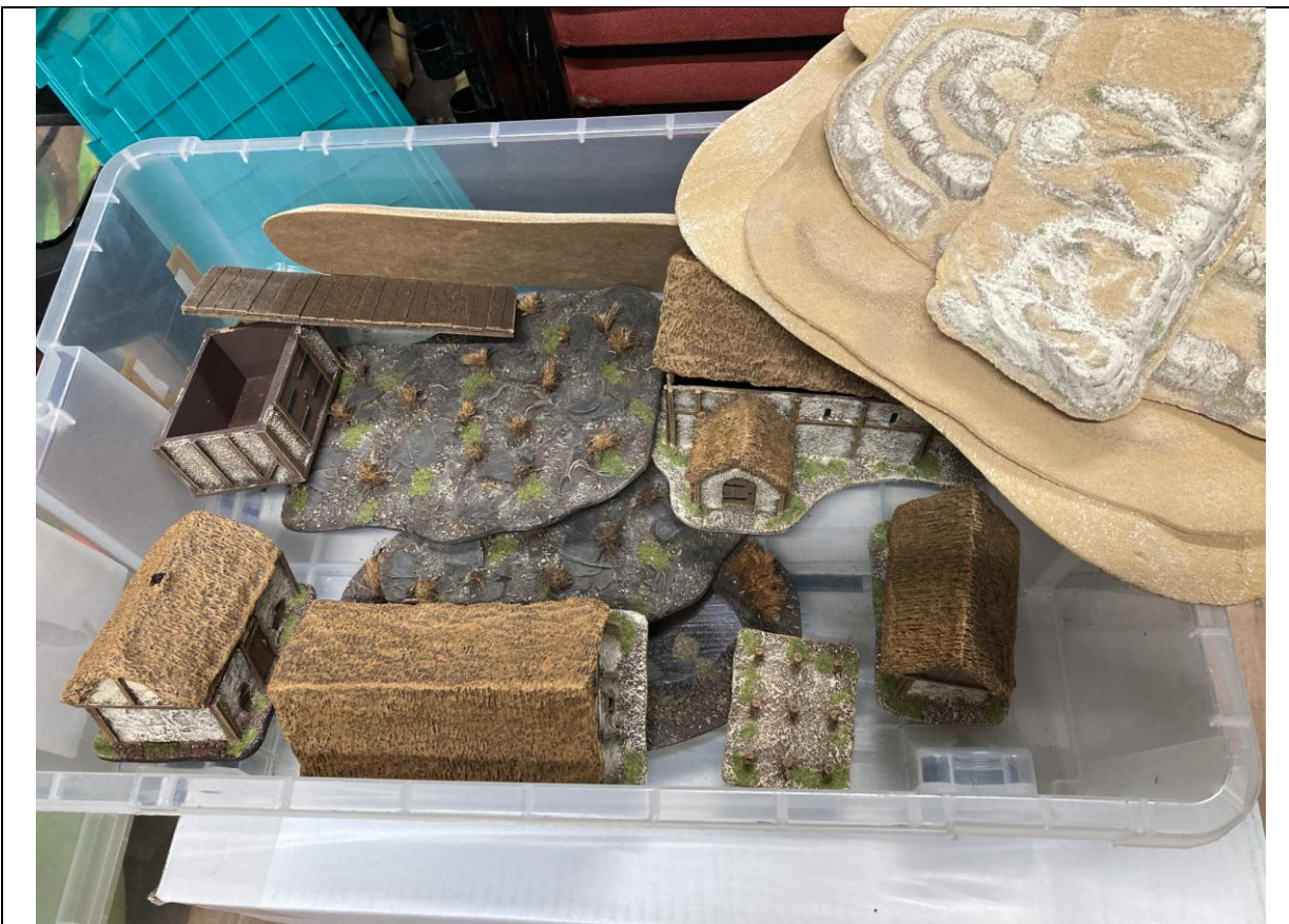
9 - 28mm Medieval houses (marshy / rough area ground terrain has gone back into box ref 13)