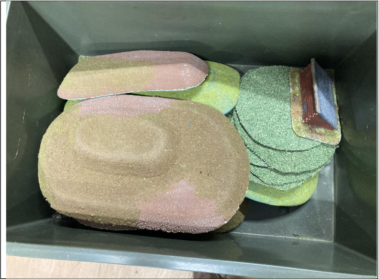
14 - Hills & Fields (the cabin has gone back into one of the buildings boxes)