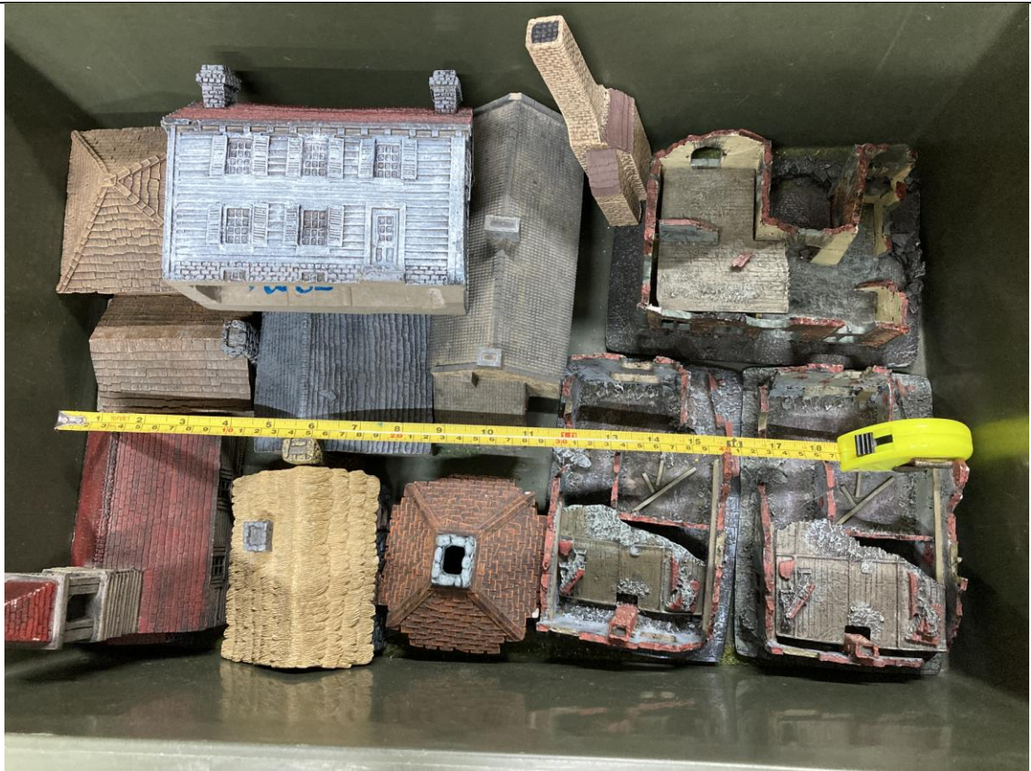
16 - 28mm Buildings 1