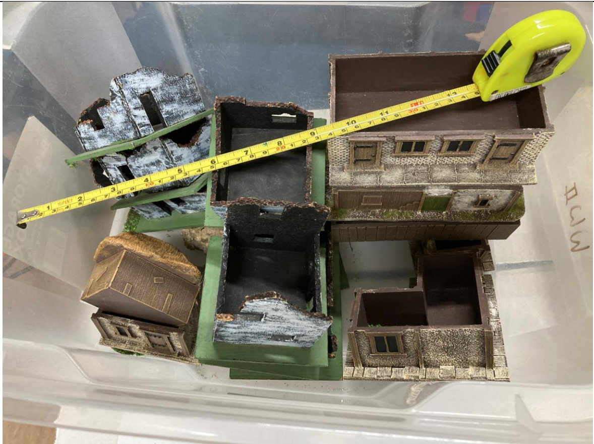
20 - 28mm Mixed Buildings