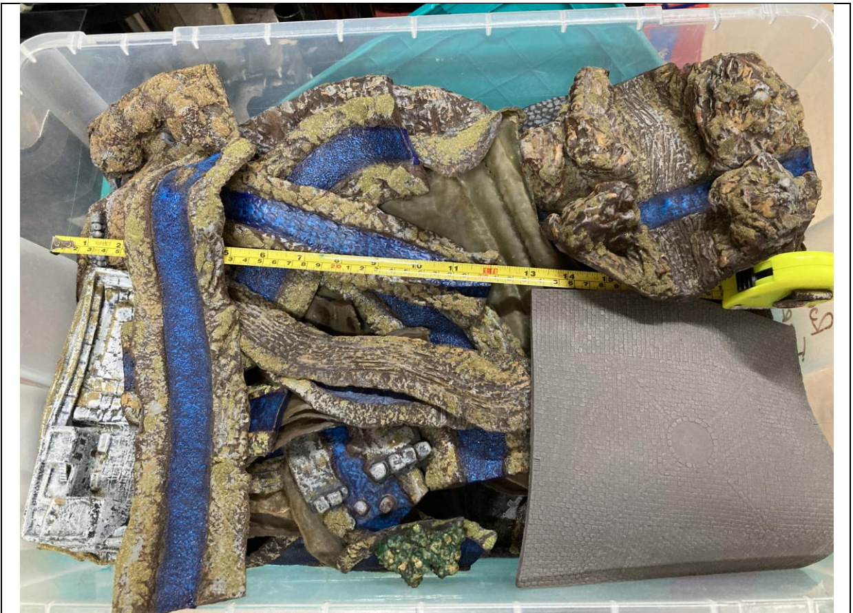
10 - Rubber Terrain