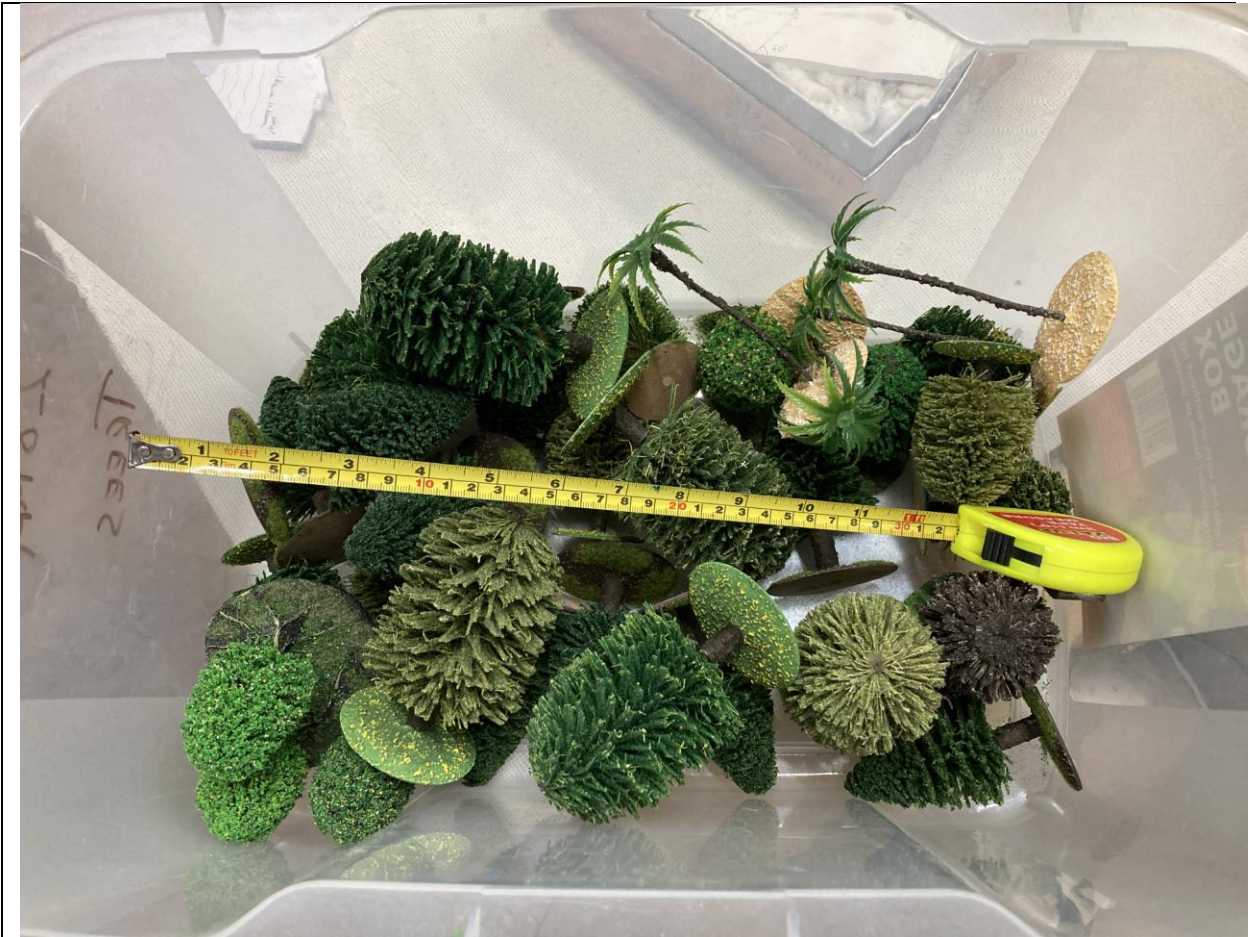
2 - 28mm Trees