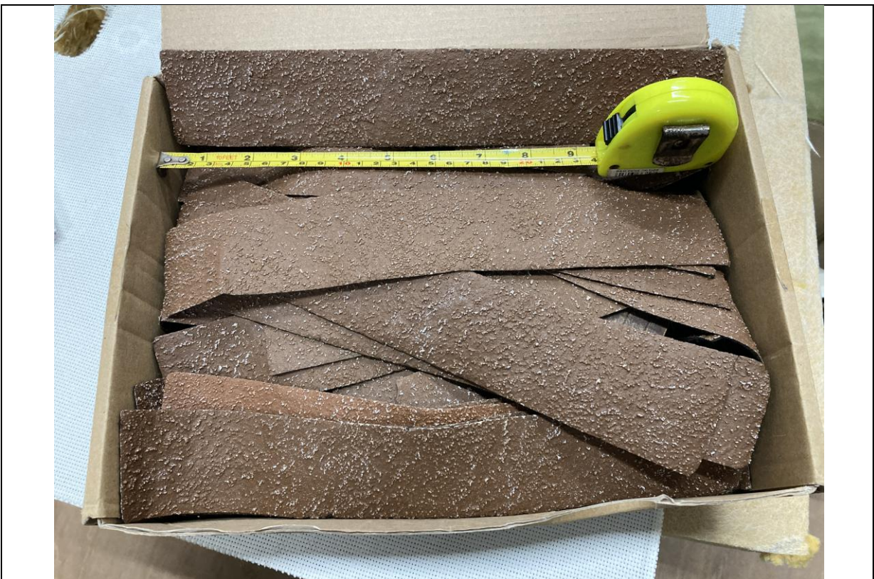
3 - Felt Roads