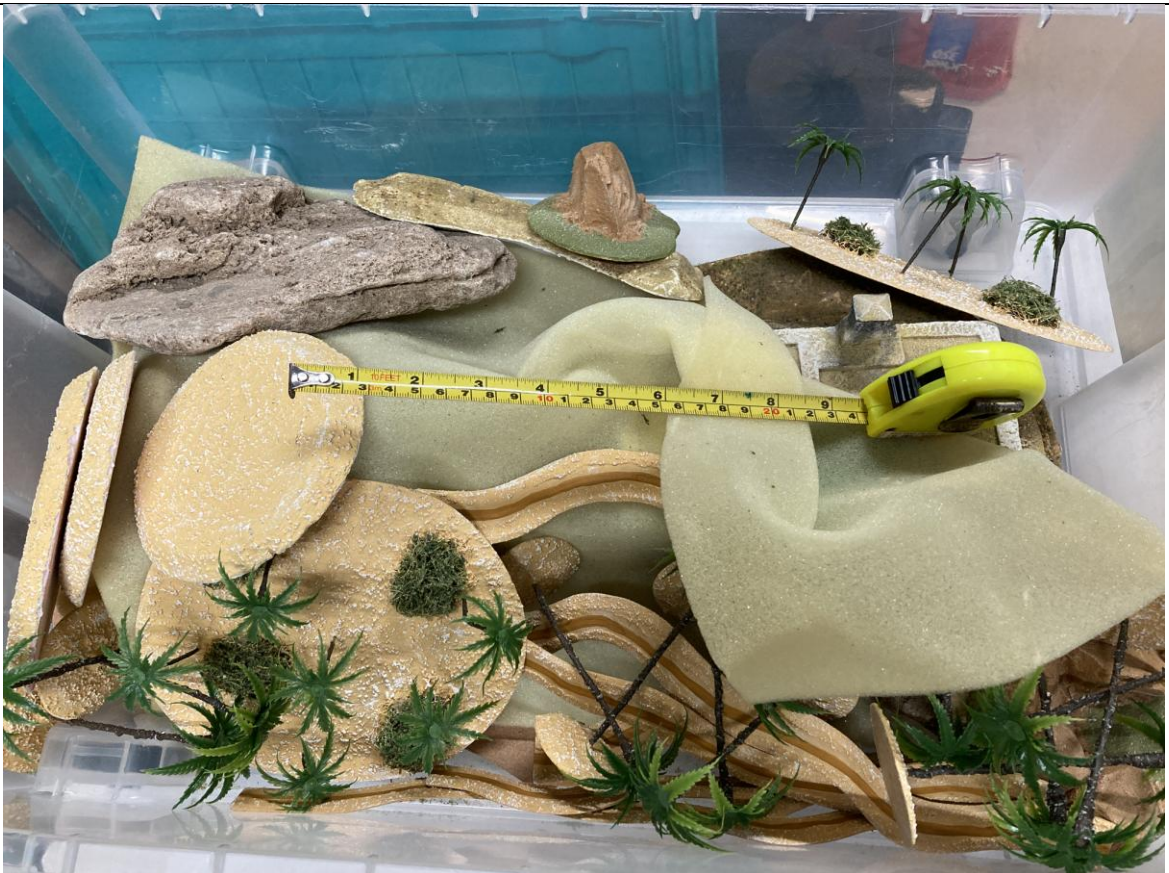
7 - 15/28mm Desert Terrain 2