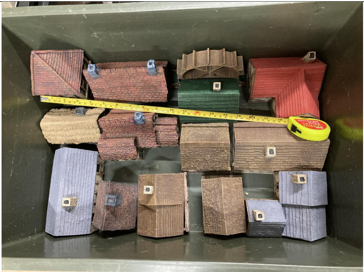
17 - 28mm Buildings 2